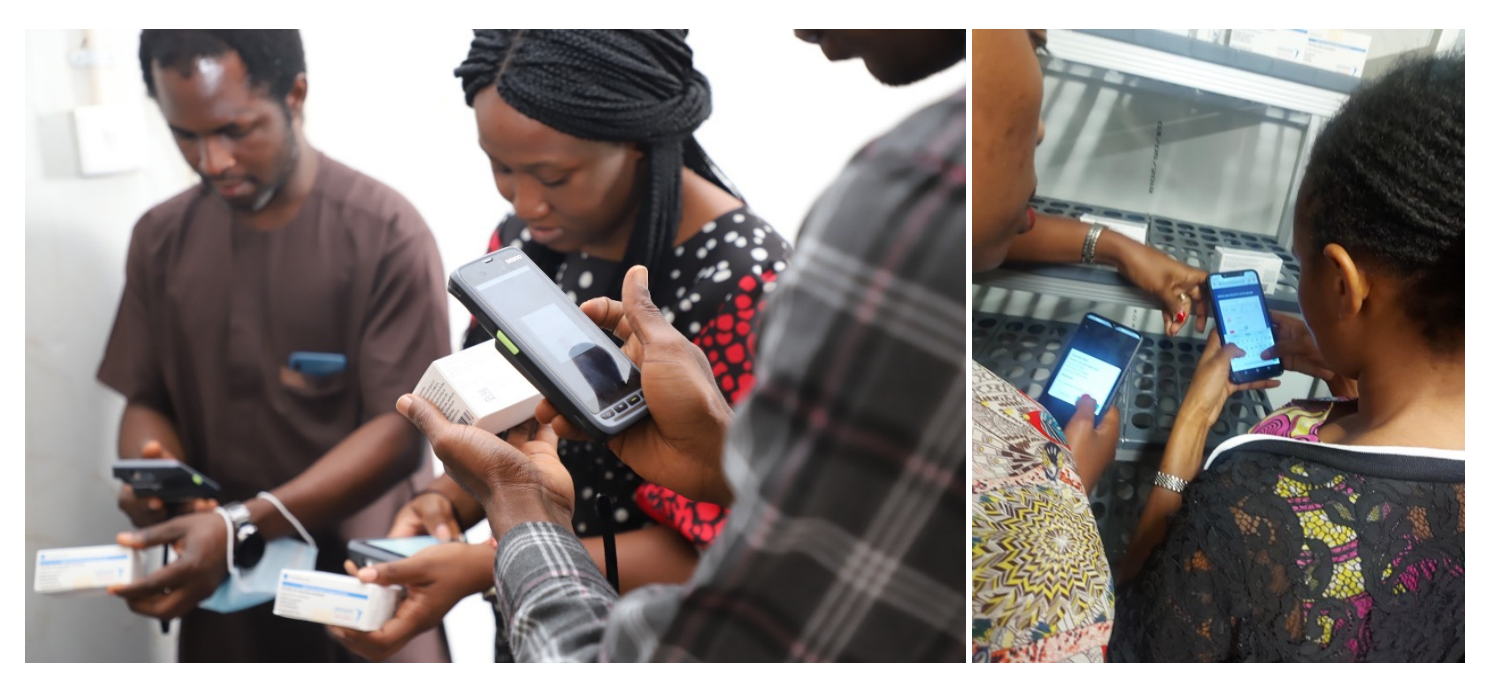
Figure 1 – Nigeria Trial and Rwanda Trial

In July 2022, during the unprecedented speed and scale of the COVID-19 vaccine rollout, TRVST was launched in Nigeria and Rwanda with the first Global Standard 1 (GS1) scans, marking a milestone patient safety and addressing the urgent risk of falsified and diverted vaccines. COVID-19 vaccines were the first products used in TRVST thanks to Johnson & Johnson providing the first batches of data into the repository. Currently, TRVST is scaling up and expanding into routine vaccines and other health products for the prevention and treatment of HIV, tuberculosis, and malaria, as well as reproductive health supplies and other essential medicines like antibiotics.